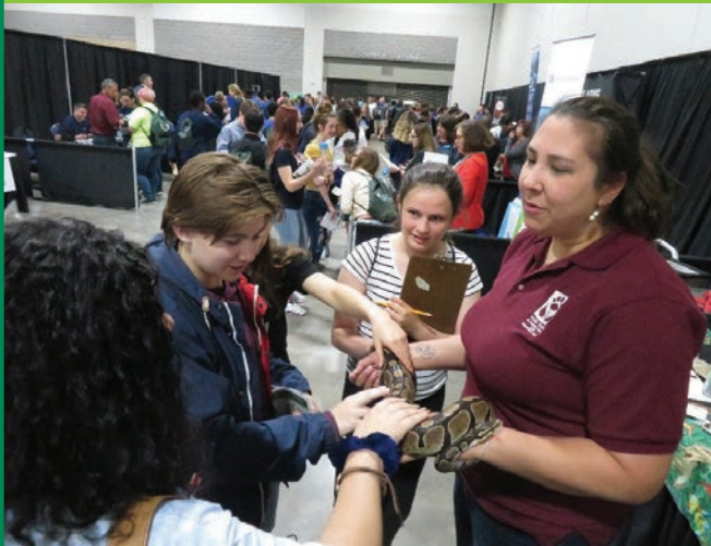
Students visiting with the staff and animals of the Forest Park Zoo.

Likert Scale Rating Where 1 is unsatisfactory/strongly disagree and 5 is outstanding/strongly agree